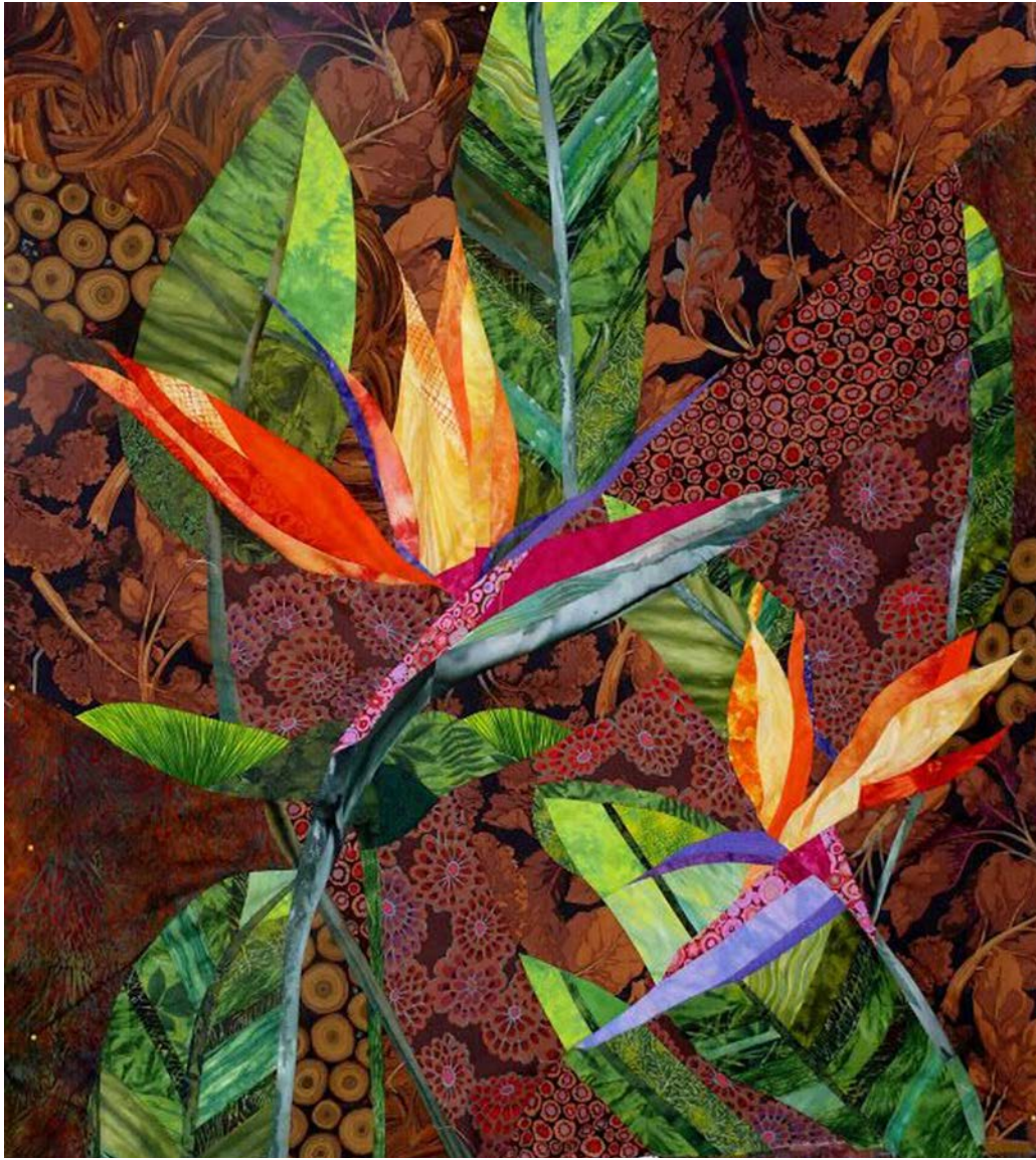
“Memories for California” by Beth Brandkamp